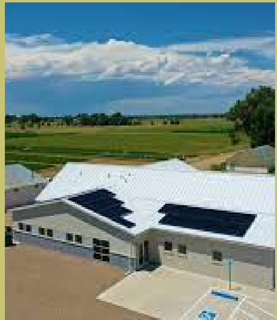
The 2022 Annual meeting was held at the Arkansas Valley Research Center in Rocky Ford

This meeting was funded in part by a mini-grant from the Western SARE (WSARE) Professional Development Program at Colorado State University, the Colorado State Land Board, the Colorado Section of the Society for Range Management, Vence and the Quivira Coalition.