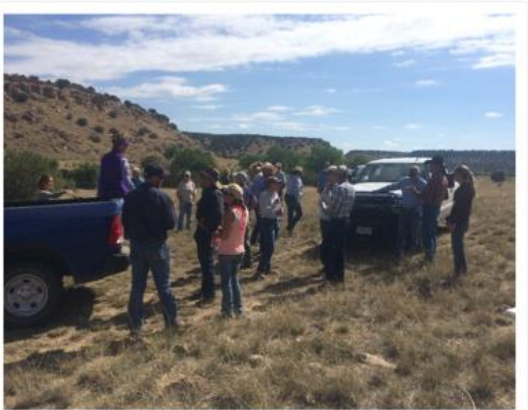
CSSRM members enjoy the tour at the Leininger Ranch in September.

The first stop of the morning took us to the Jack Canyon state land leased property south of the main ranch. Here we viewed the many water development and fencing improvements that the Leininger's have implemented to facilitate prescribed grazing. Barb explained that this controlled grazing practice has allowed for shorter grazing periods and longer recovery periods to improve the rangeland condition on the entire ranch.