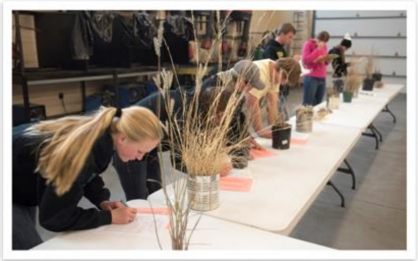
Plant ID judging at Regional Contests involves identifying the common names of 30 range plants along with important characteristics of each plant.

FFA Range Judging is getting into full swing. Preparations are underway for the upcoming regional events as well as the Eastern Colorado State FFA Range Judging and Plant Identification Career Development Exercises (CDE's). The first of these activities, Northeast Colorado Regional FFA Range Judging, was held on September 17 at the Prairie School in New Raymer. This event was hosted by the Prairie FFA Chapter. The Southeast Colorado Regional contest was held on September 26 at the Rocky Ford fairgrounds. This event was hosted by the Fowler and Rocky Ford FFA Chapters. The state event is scheduled for October 3. It will be held on the campus of Northeast Junior College in Sterling, with the hosting chapters being Lone Star and Merino FFA.