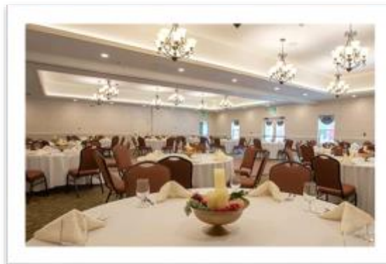
Ballroom where the workshop will be held.