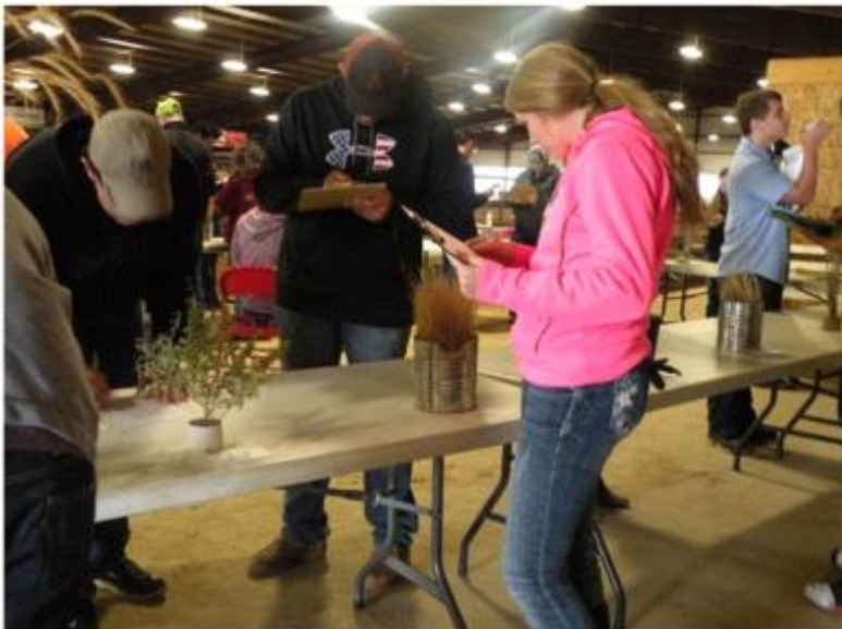
State FFA Range Judging requires the students to know the common names or 50 range plants along with the characteristics important to range management.

FFA range judging involves the students in judging the condition of two ecological sites. Several attributes are determined by the students including ecological site name, plant composition, range condition class, vegetation basal and litter cover, suggested stocking rate, apparent rangeland trend, and recommended best management practices.